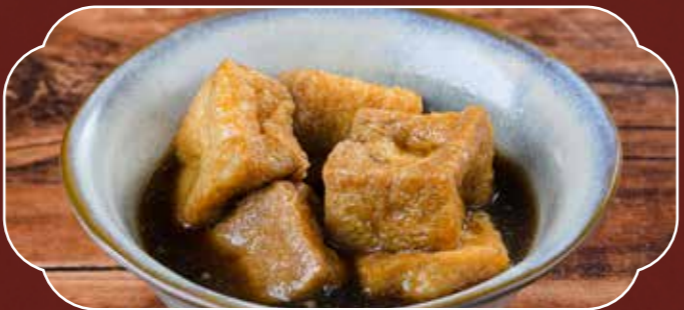
Tau Pok (Tofu puffs) 豆卜 (油豆腐) RM10.00