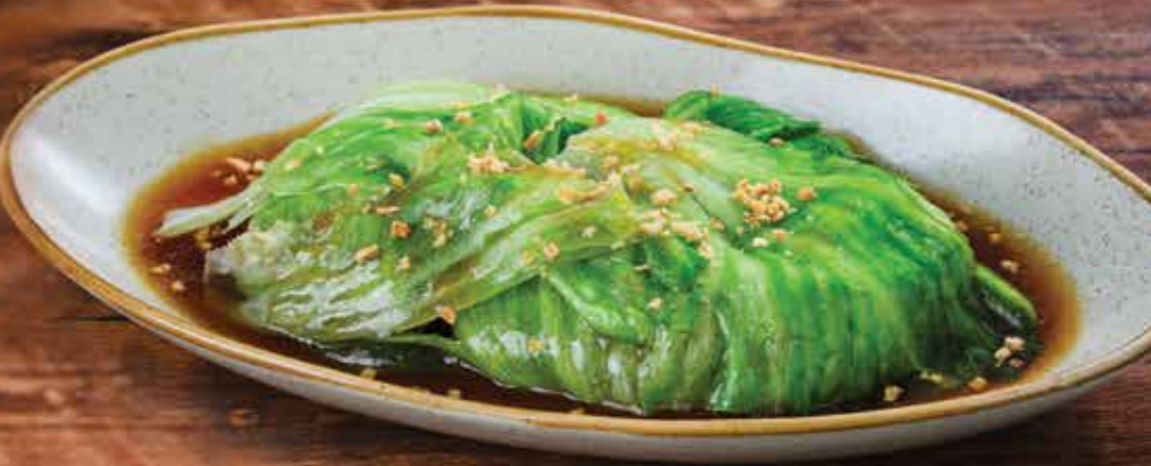
Iceberg Lettuce 生菜 RM10.00