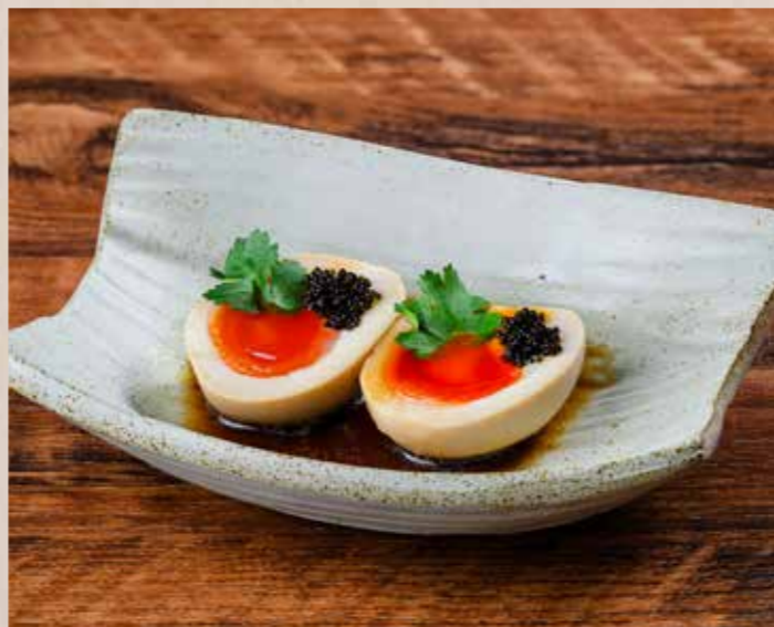
Bak Kut Teh Lava Egg 肉骨茶滷心蛋 Lava egg in homemade bak kut teh sauce topped with black tobiko RM 5.00