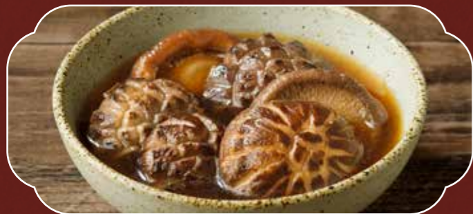
Shiitake Mushroom 香菇 RM10.00