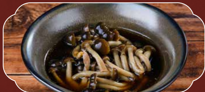
Shimeji Mushroom 蟹味菇 RM10.00