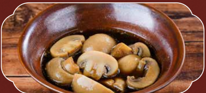
Button Mushroom 口磨菇 RM10.00