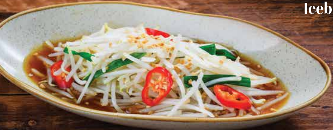
Beansprouts 豆芽 RM10.00