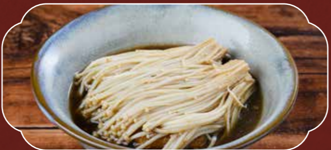
Enoki Mushroom 金针菇 RM10.00