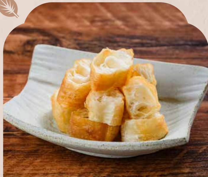
Dough Fritters 油条 RM 4.00