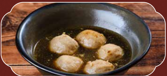
Meatball 肉丸 RM10.00