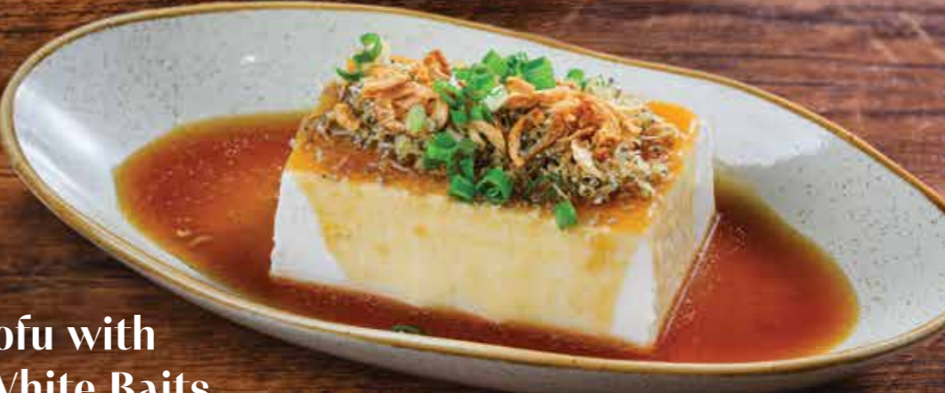
Steam Tofu with Crispy White Baits 葱油酥脆银鱼豆腐 RM15.00