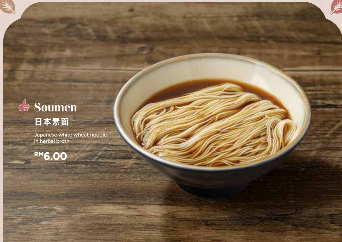
Soumen 日本素面 Japanese white wheat noodle in herbal broth RM 6.00