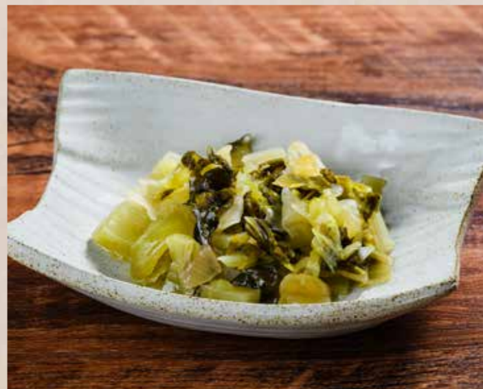
Salted Vegetables 咸酸菜 RM 4.00