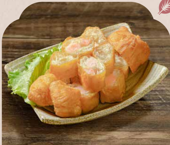
Dough Fritters with Prawn Paste 虾滑油条 RM 12.00