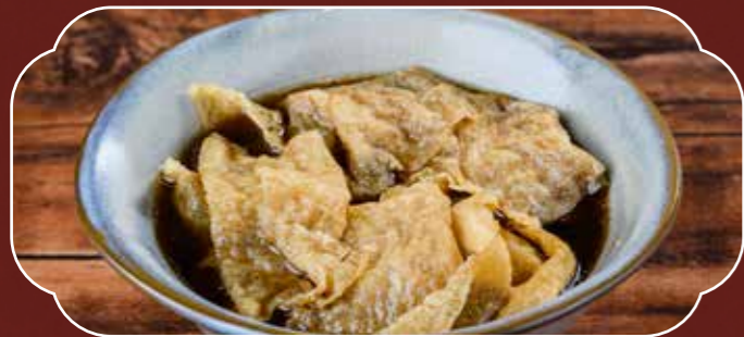
Tau Kee (Fried beancurd skin) 炸豆支 (腐竹) RM10.00