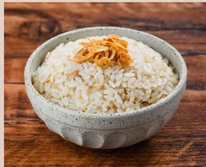
Japanese Scallion Rice 葱油饭 (日本米) RM 4.00