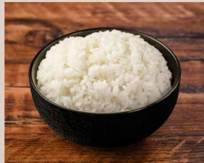
Japanese White Rice 白饭 (日本米) Japan's Aomori Masshigura rice, known for its firm texture, low viscosity, and clean taste, reflects a commitment to exceptional quality and flavor. It is now Aomori's leading rice variety RM 3.00