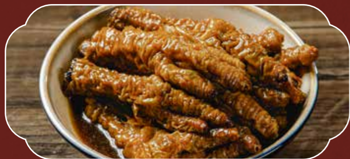
Chicken Feet 鸡脚 RM18.00